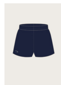
P.E. Shorts Nursery - Form 6

A full uniform list can be found on the school website. Please refer to the OHS Parent Handbook and Essential Information document emailed to all parents for further information.