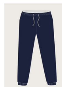
Navy Joggers Nursery only