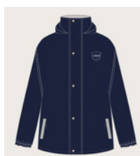
Stormproof Coat Nursery to Form 6

All orders should be placed online via the schoolblazer website.