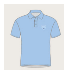
Blue Polo Shirt Nursery - Form 6