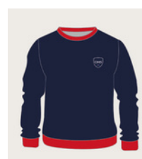
Crew-neck Jumper Nursery only